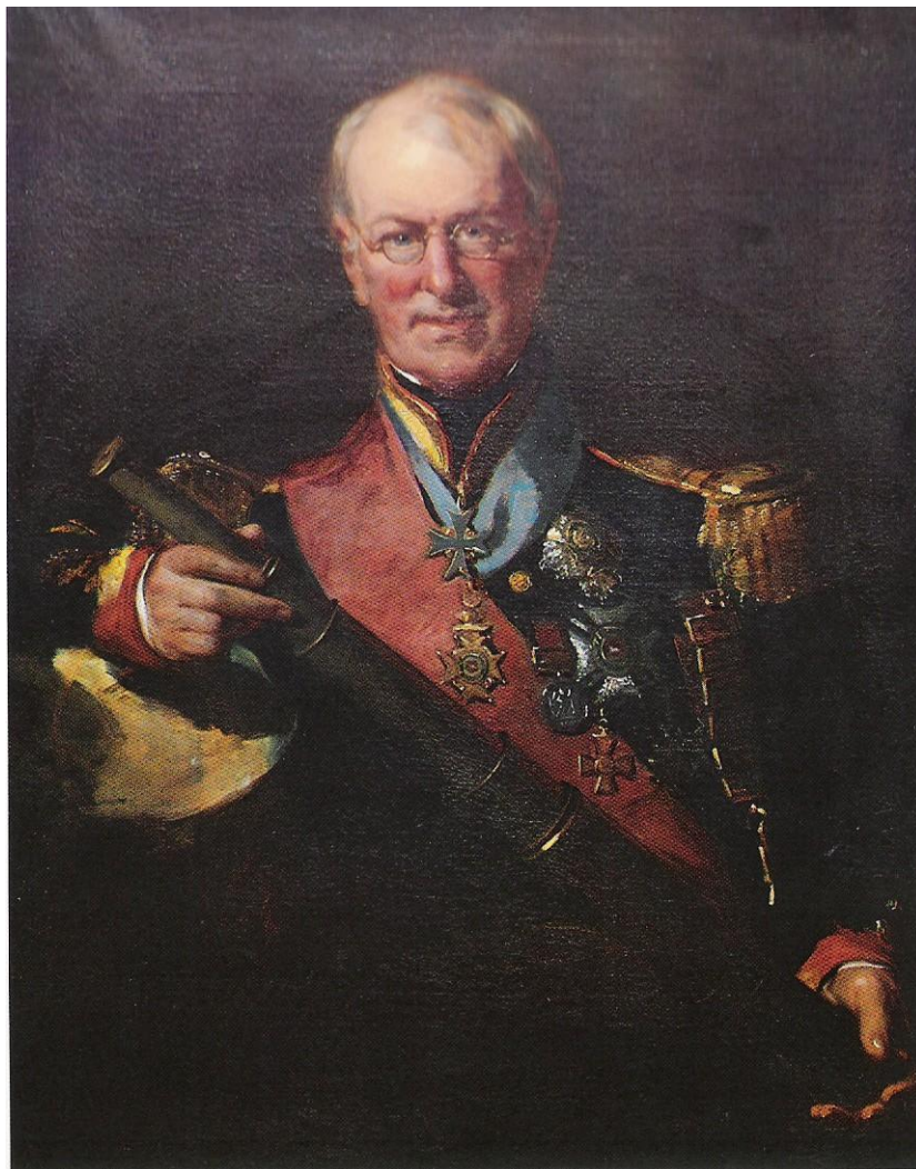
Major General Sir Alexander Dickson GCB KCH

The siege train demanded from England the previous winter had now arrived off La Coruña and was being transported to Santander by Major Augustus Fraser. Wellington tasked Dickson with besieging San Sebastian while his main force continued to press the French in the northeast. The first siege was a failure, through no fault of the gunners, who had blasted two practicable breaches; but with Soult manoeuvring menacingly near the French border 37 , Wellington ordered the guns to be withdrawn and he turned his attention to meet this developing threat. The Battle of The Pyrenees 38 resulted, leaving the allies poised for the final assault into southern France. Wellington was keen to leave no stone unturned and ordered Fletcher 39 and Dickson to resume the siege of San Sebastian. It was a costly affair but by the 8 th September the key town was in allied hands. A month later, Wellington crossed the River Bidassoa in a daring and calculated operation. Dickson called forward the 3-pounder guns from Lisbon and established a mountain battery under the 6 th Division and two 3-pounder troops under the Light Division and General Giron's Spanish Reserve. Allied successes followed at Nivelle and the Battles on the Nive before the final showdown in Toulouse the following spring. During this latter period of the war, Dickson had about 8,000 men, over 200 guns and approximately 3,500 horses under his direct command.