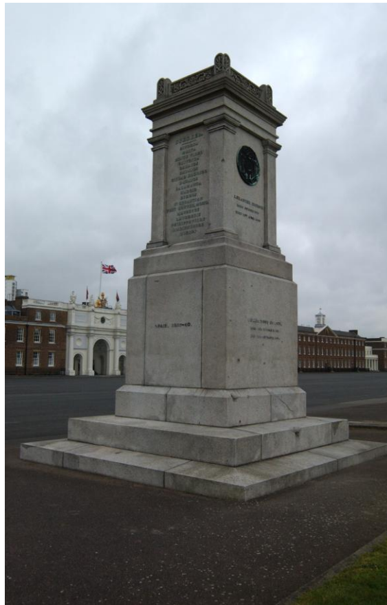
The Dickson Memorial at Front Parade Woolwich - prior to the move to Larkhill.

Royal Military Repository at Woolwich; this was moved in 1911 to Front Parade, Woolwich and again in 2007 to Larkhill, Salisbury, when the Royal Artillery vacated Woolwich after 291 years. His brother officers paid for the monument, a fitting bequest to an officer who was pre-eminently the first artilleryman of his day and one of the most popular who served under the Duke of Wellington.